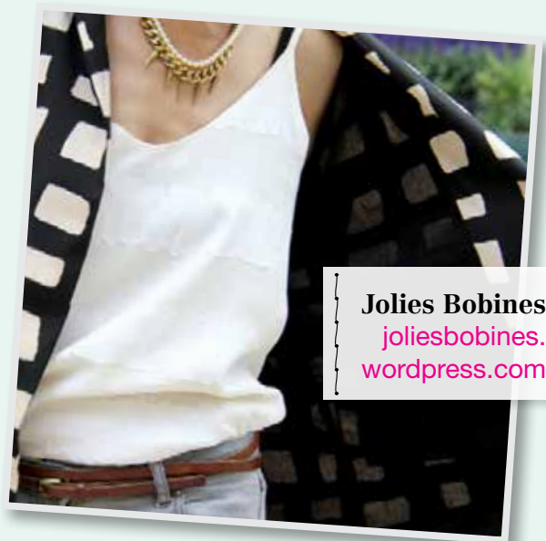
Jolies Bobines joliesbobines.wordpress.com