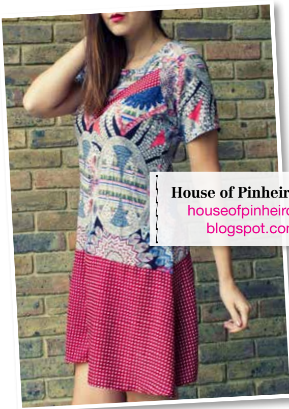
House of Pinheiro houseofpinheiro.blogspot.com

A globe trotting blog documenting pattern drafting, sewing projects, and inspiration along with travel stories.