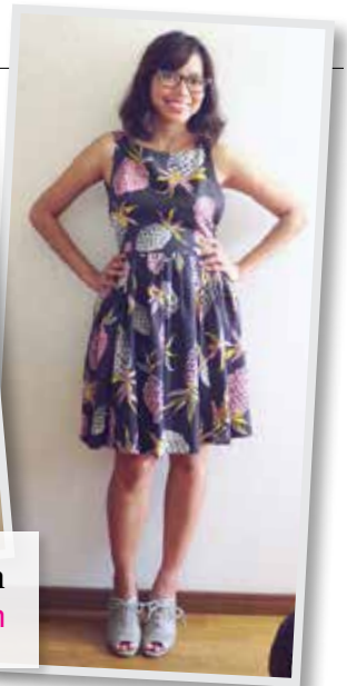
Very Purple Person verypurpleperson.com