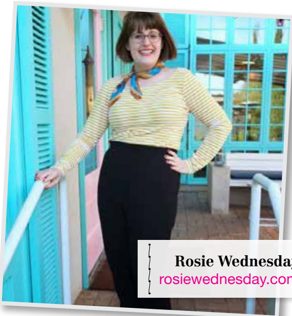
Rosie Wednesday rosiewednesday.com